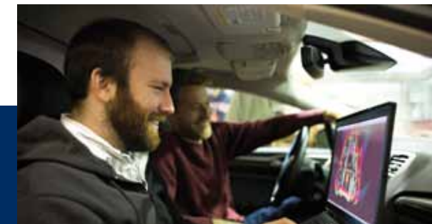
Students are working on a project to bring automated vehicles to Ann Arbor.

This course emphasizes hands-on design and development of games, including the underlying computer science and technology that supports game development.