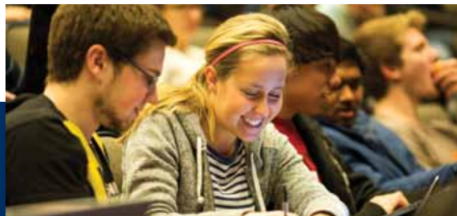
Students work together to solve a problem during a course.

Gaining a Minor in Computer Science is a smart way to broaden your horizons and make yourself more marketable to employers. The CS Minor is open to students in the College of Engineering, LSA, Music, and the Ross Business School.