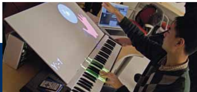
A student in the CS sound lab experiments with new interfaces and modalities for musical expression.

As a CS student, you'll gain expertise in the development of software systems for applications, in creating and analyzing algorithms for a variety of applications, or in designing a new and emerging area of specialization. It's a field of unbounded potential – get ready to change the world!