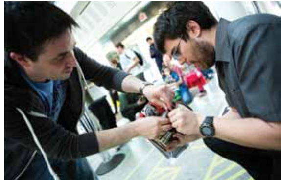
CS students adjust their robot prior to a project demonstration.

Computer science is shaping the future. A degree in computer science can help shape yours.