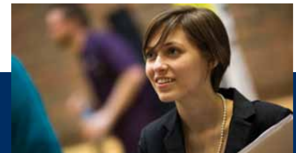
A student meets with a job recruiter at the fall career fair.